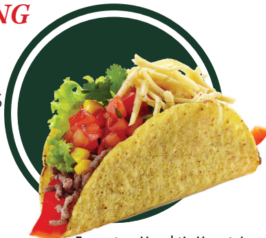
Featuring Macski's Haggis!

JOIN IN , ALL COMERS WELCOME TO COMPETE FOR THE HAGGIS TACO EATING PRIZE ONLY HERE AT SCOTTISH FEST.