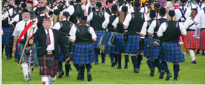
The Highland Competition is made possible by a gift from Joel Zielke